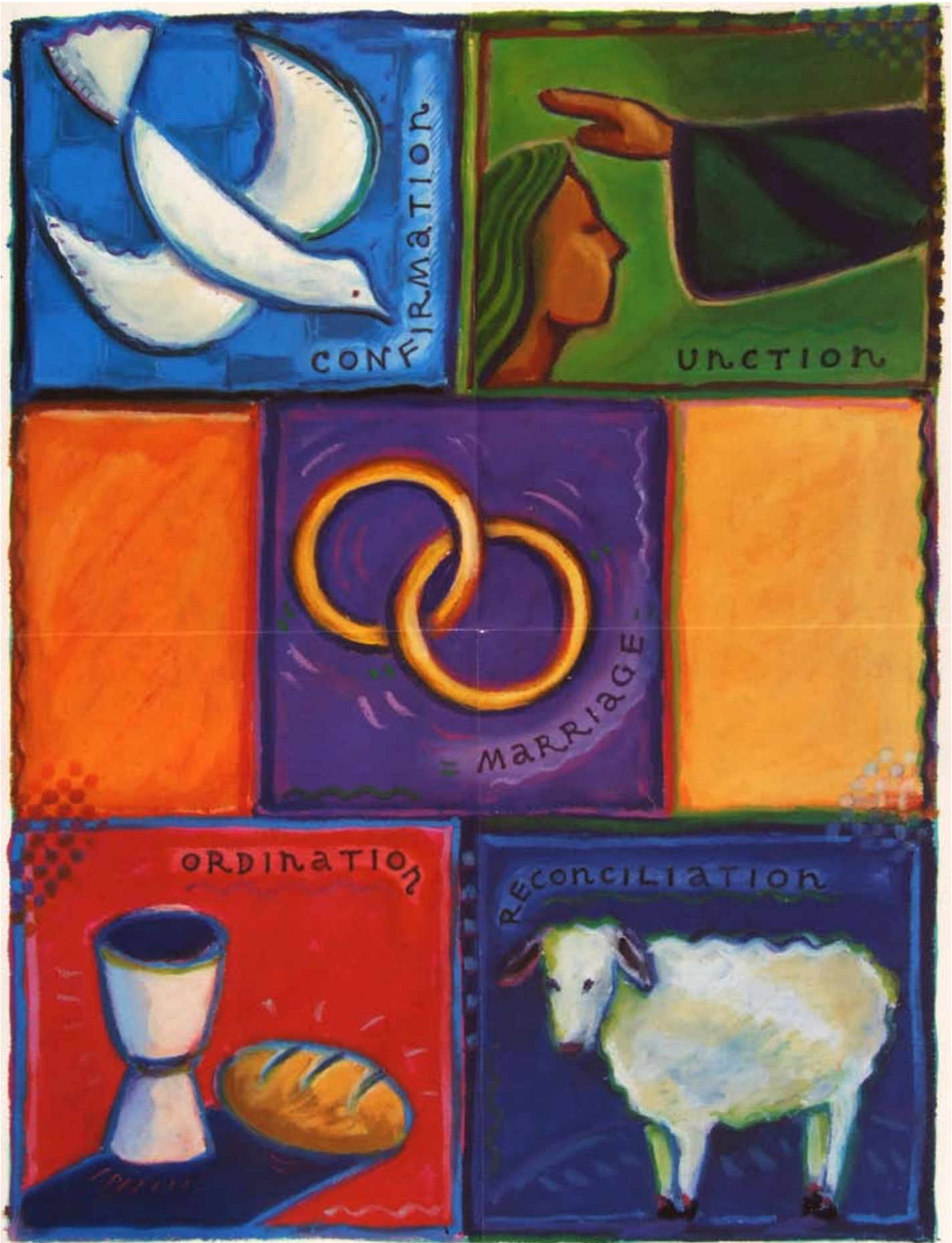
Sacraments of the Church Poster #4 Symbol Composite