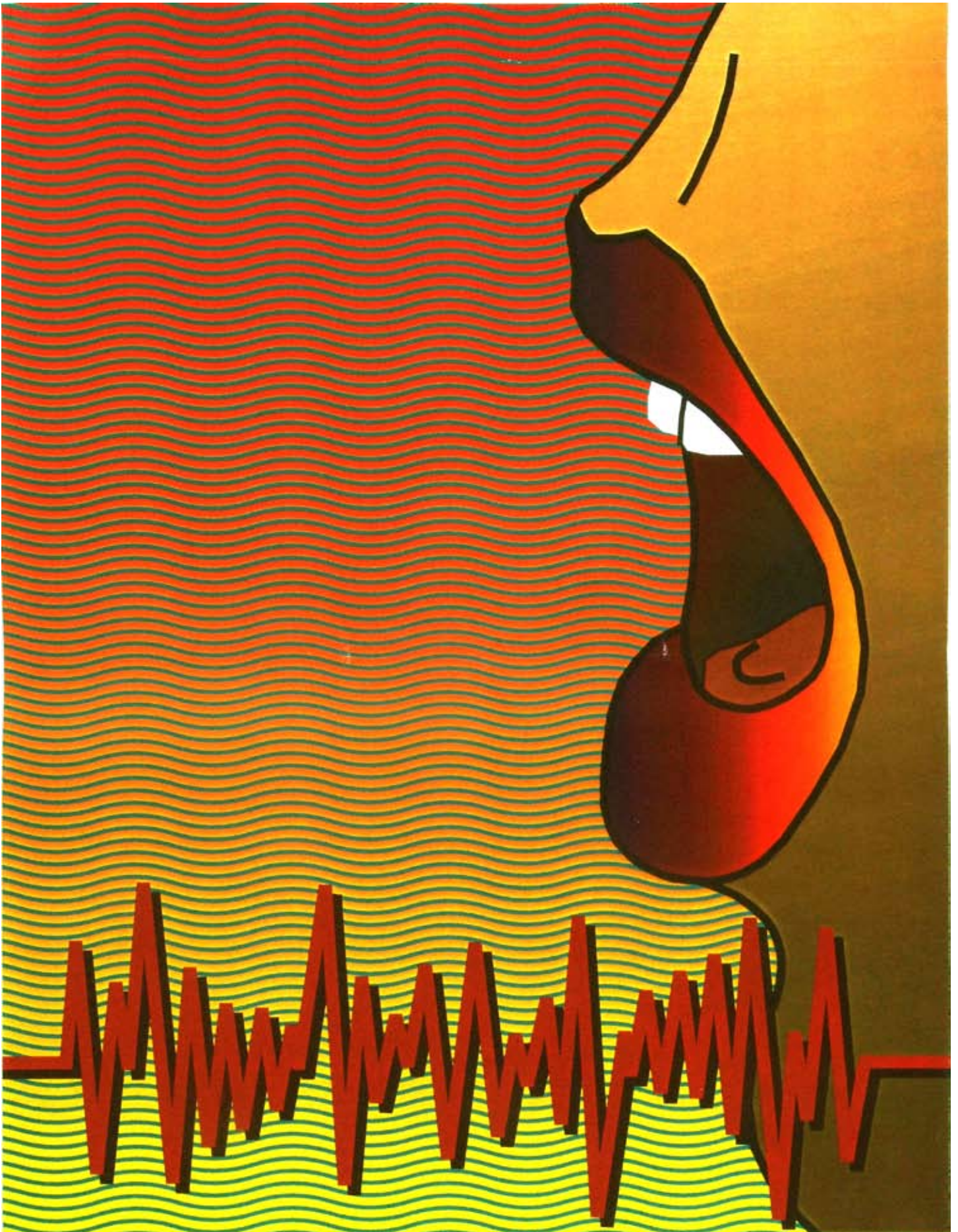
Sacraments of the Church Poster #2 Scream