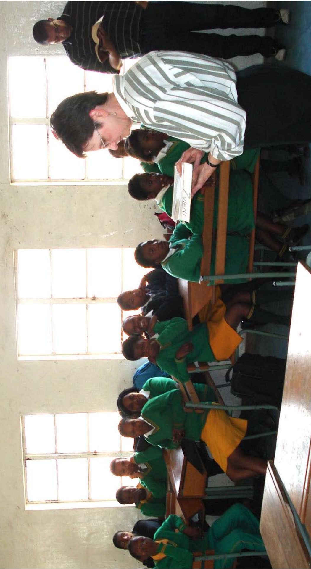
Called through Faith Poster #6 Worshipping Together