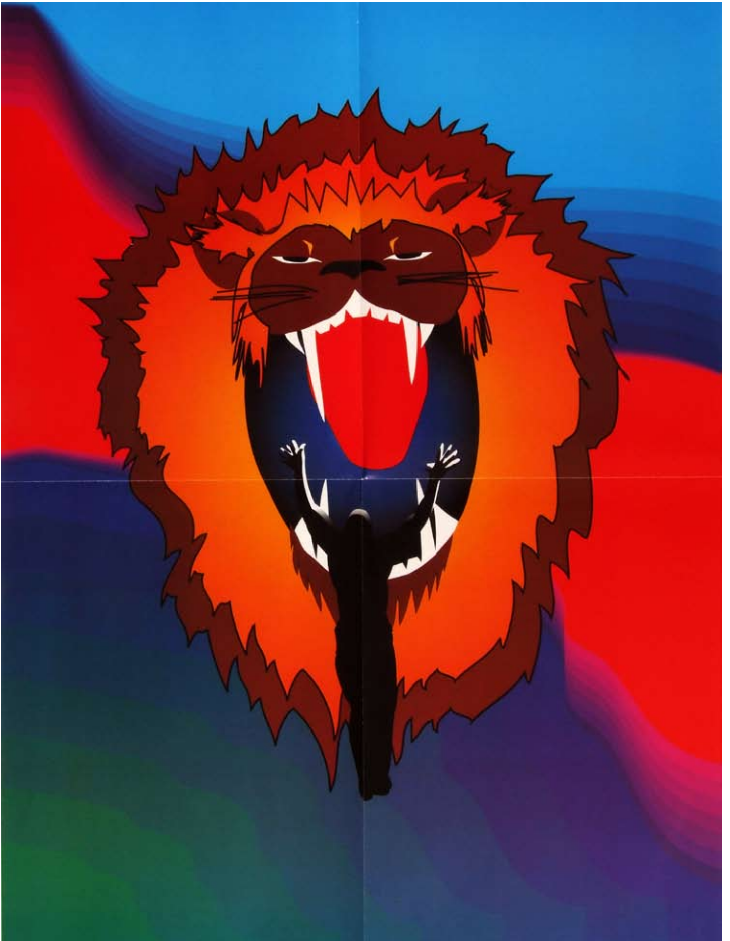
Called through Faith Poster #5 Facing Evil