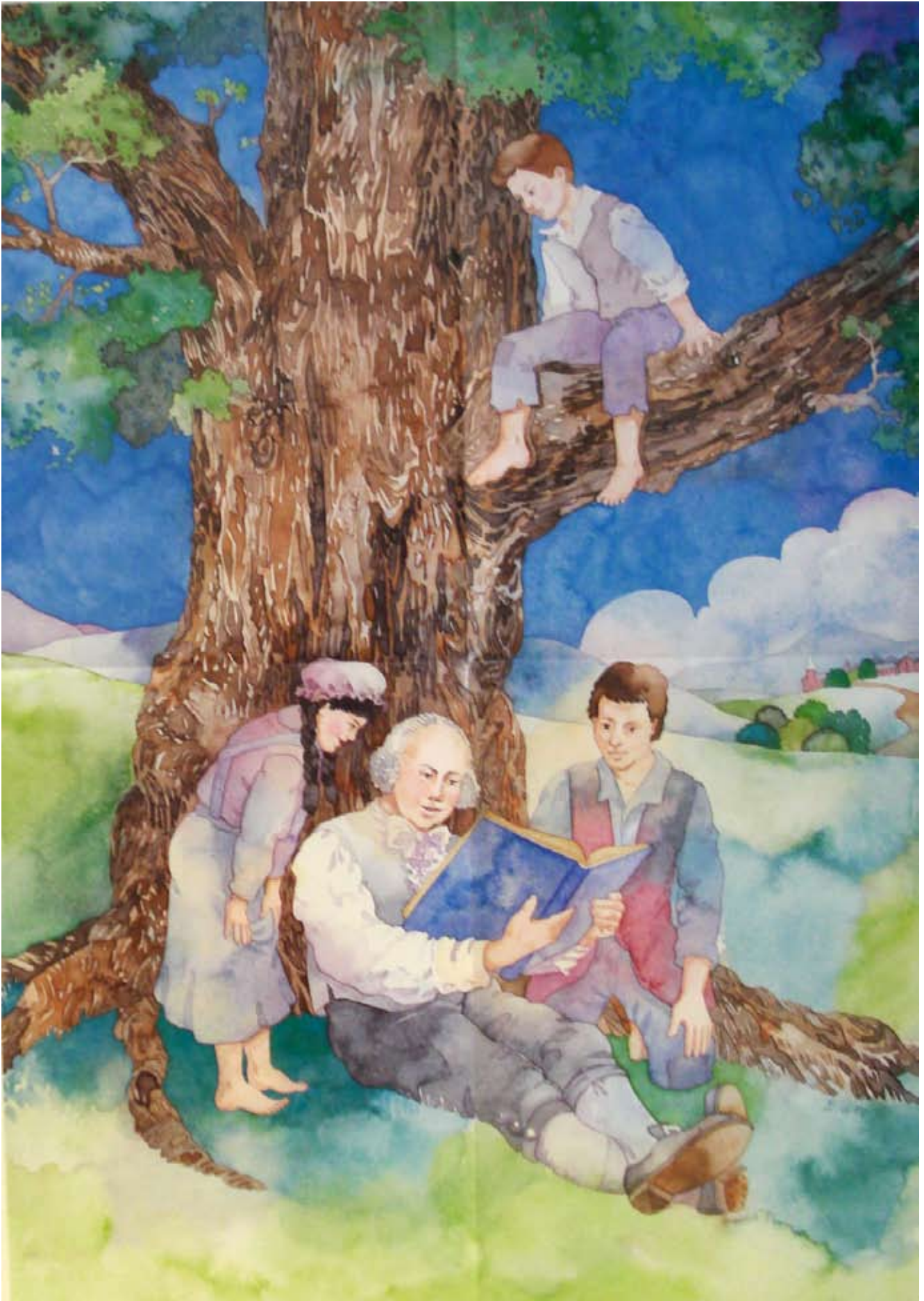
Called through Faith Poster #4 Drawing Children to God