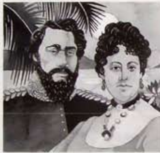
KAMEHAMEHA & EMMA