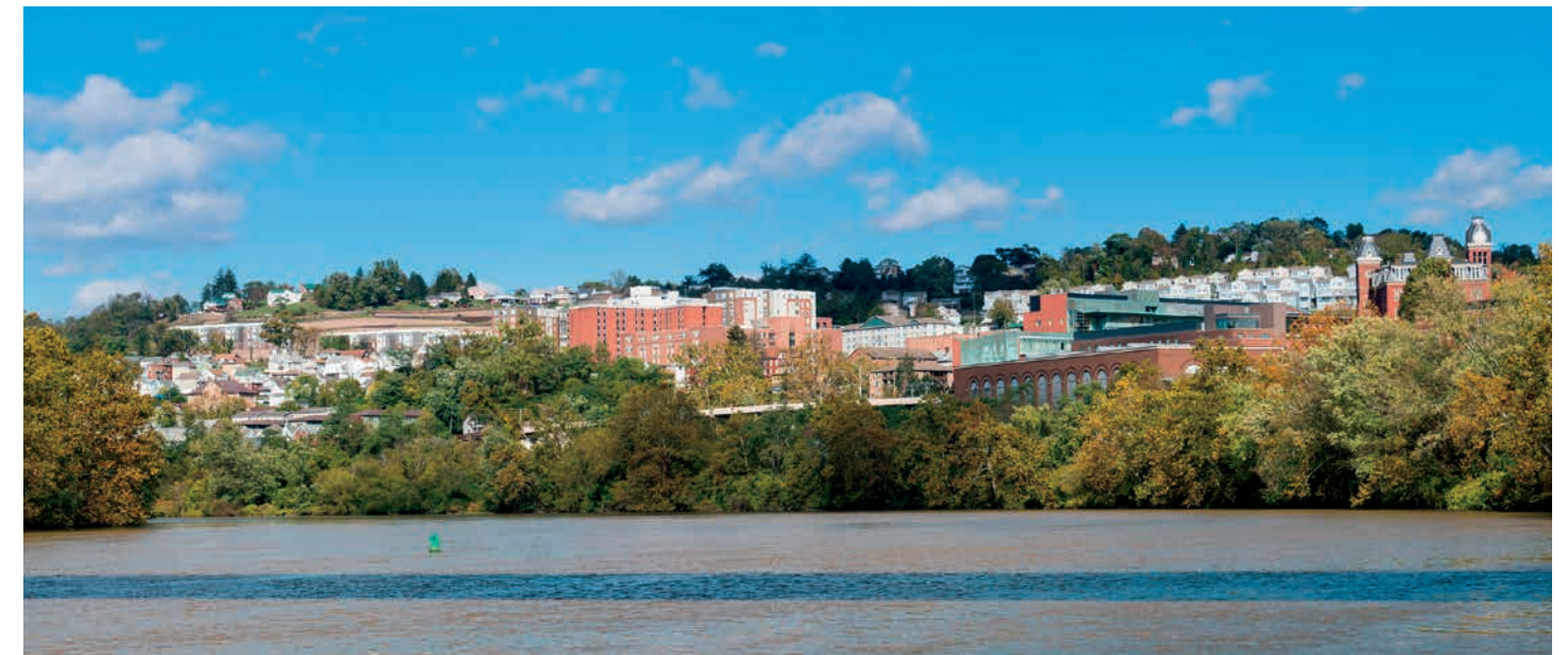
Morgantown, West Virginia