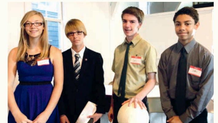
Church of St. James the Apostle, Oakland, California