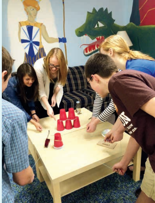
Church of St. Michael the Archangel, Colorado Springs, Colorado