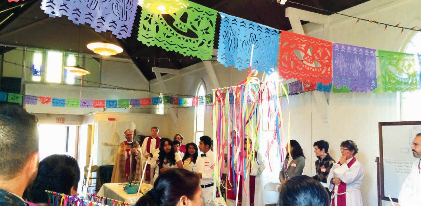
Church of St. James the Apostle, Oakland, California