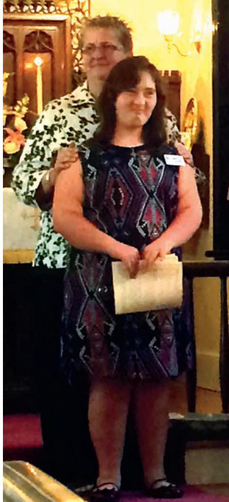
Leeds Episcopal Church, Markham, Virginia

Mentoring embodies the spiritual practices and teachings of faith traditions and, as part of confirmation preparation, helps equip young people to “go and do likewise.” Before embarking on a mentoring program, churches need to explore the best practices suggested by secular mentoring research. One organization that has been doing this kind of research for 25 years is the National Mentoring Partnership. Its goal is providing mentoring programs the tools that “deliver on the promise of being a powerful driver of support and opportunity for young people of all ages.”