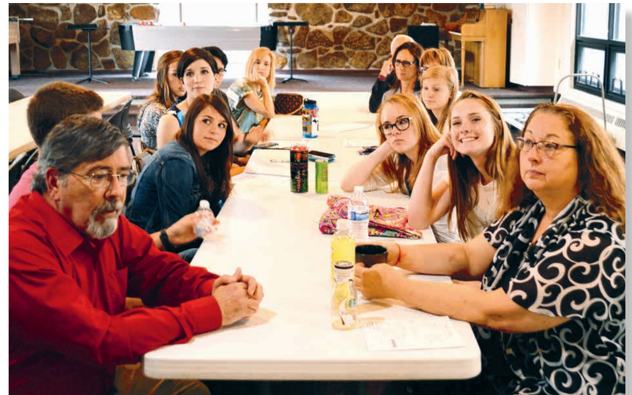
Church of St. Michael the Archangel, Colorado Springs, Colorado

While confirmation is not the unfinished work of the Holy Spirit, it may provide exactly the ecclesiological structure we need to transmit a living faith to the next generation, particularly as doing it as we have always done it religious affiliation declines precipitously.