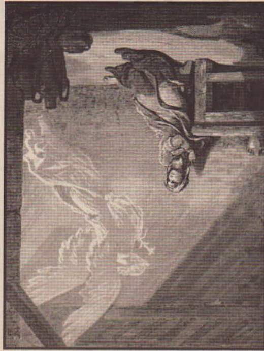
The Annunciation, Gustav Doré