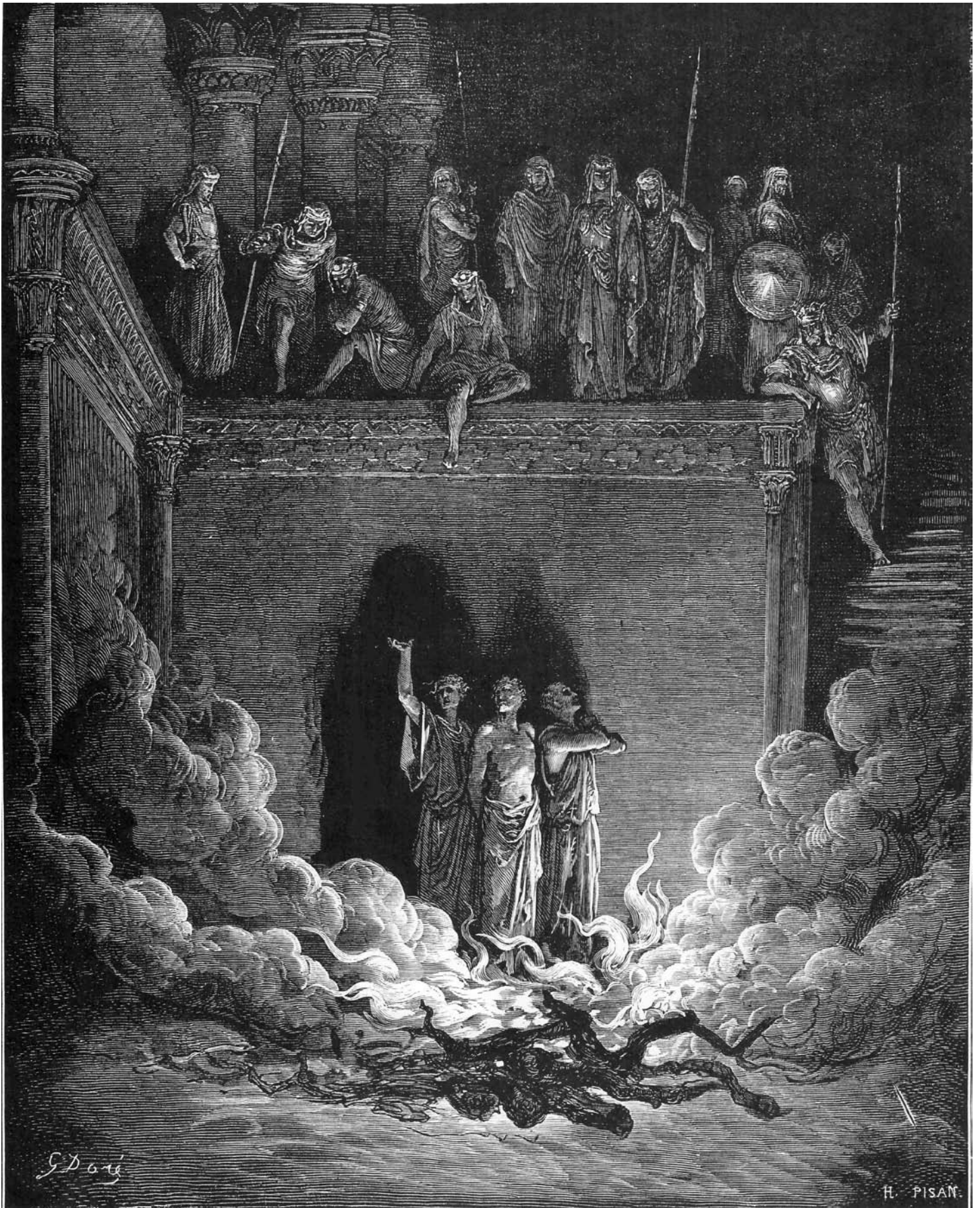
Community Leaders Poster #5 In the Fiery Furnace