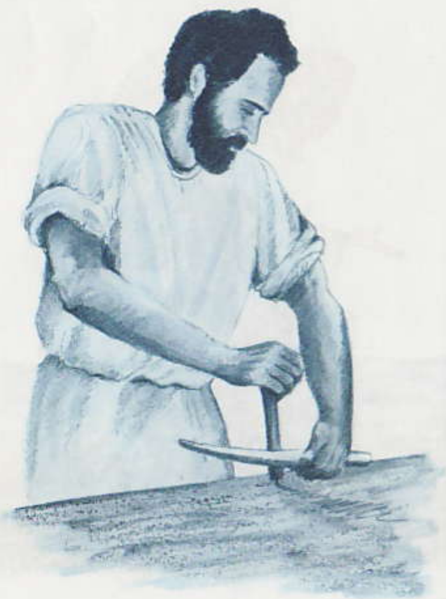
Joseph went with Mary