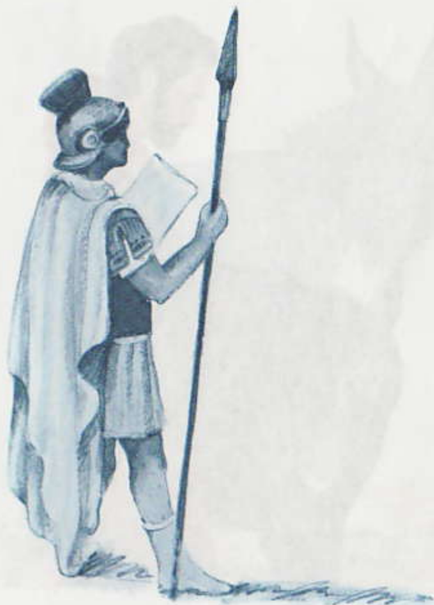
to pay the Roman tax.