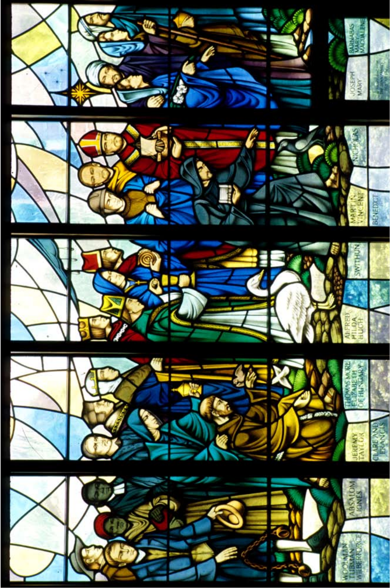
Witnesses in the World Poster #2 Martyrs' Window