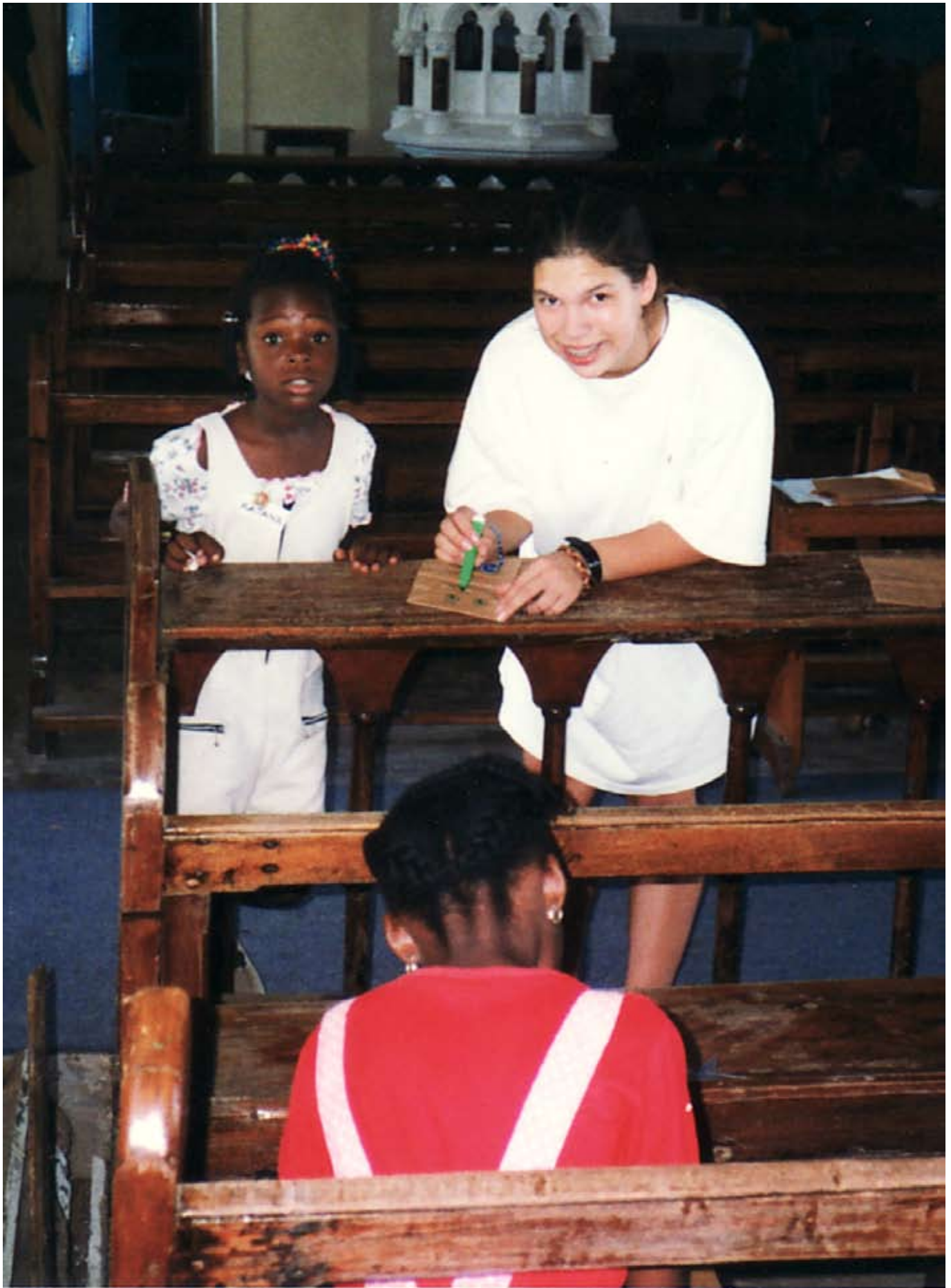
Witnesses in the World Poster #4 Helping Others