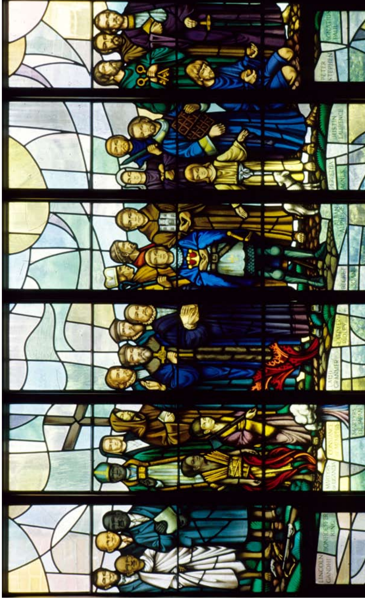
Witnesses in the World Poster #2 Exemplar's Window