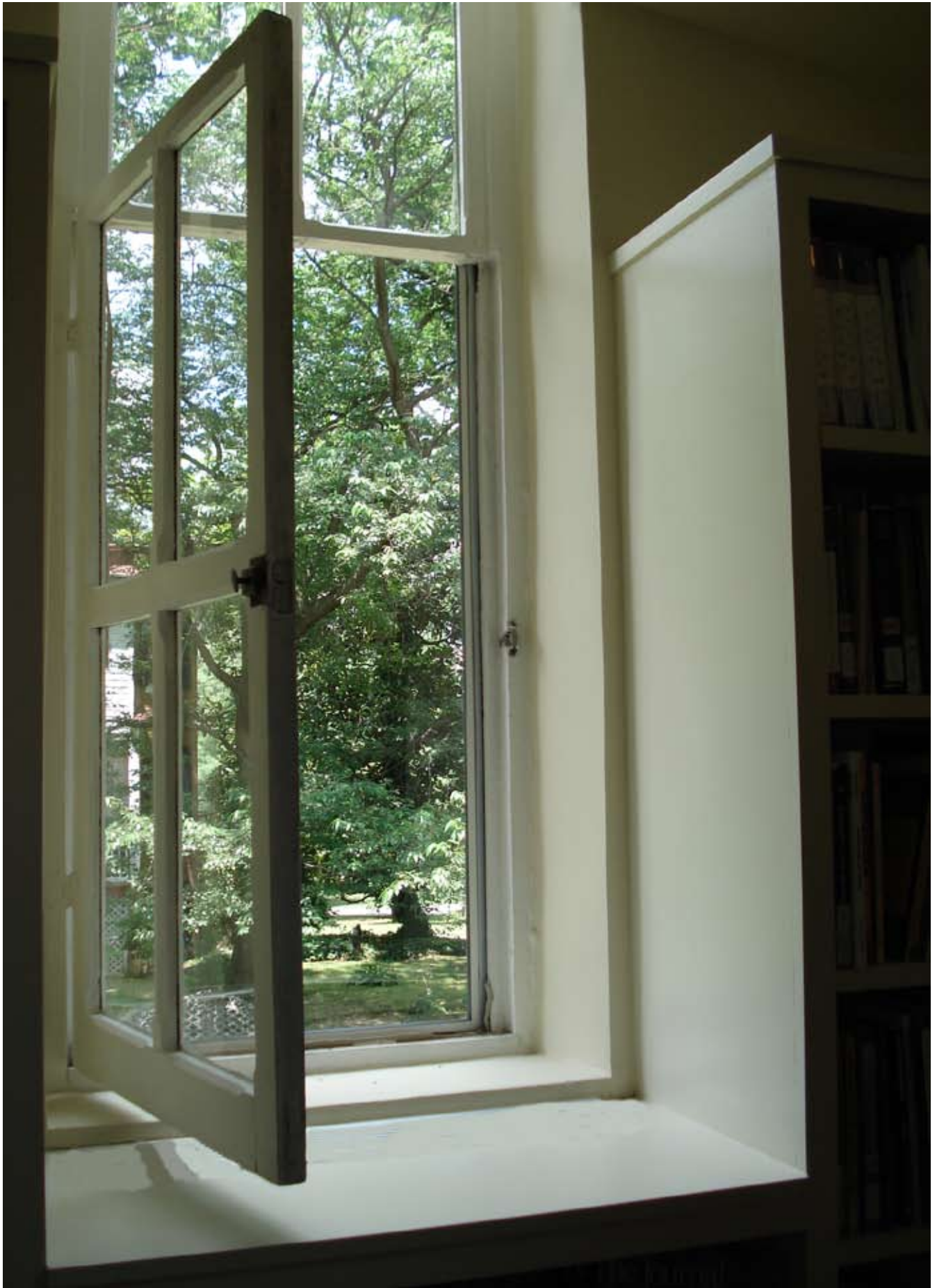
Witnesses in the World Poster #1 Window of Opportunity Sessions 4,6,7